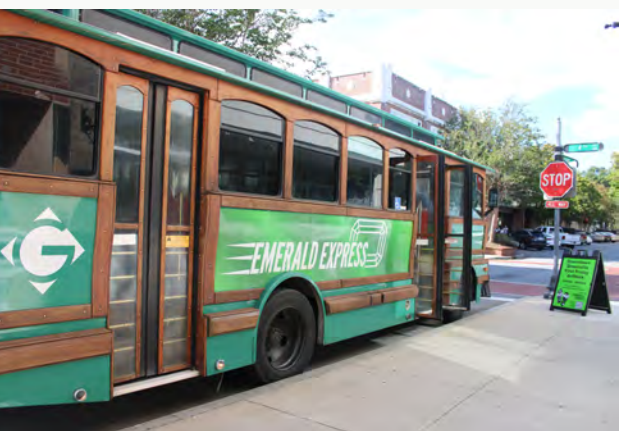
Downtown Greenville First Friday ArtWalks