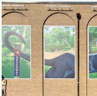
Five Points Archway Mural