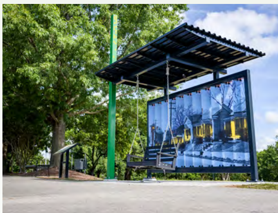
Greenville Town Common Shelter