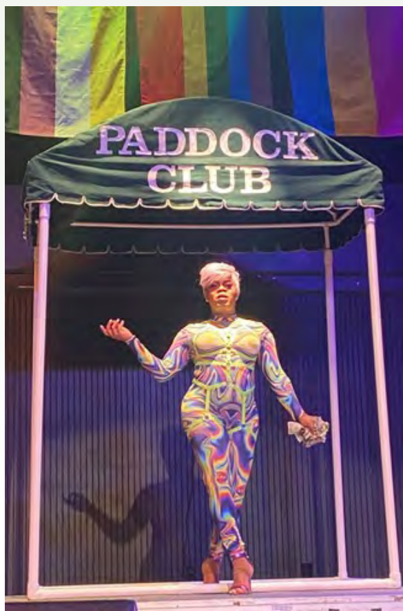
Quarterly Paddock Club Pop Up Events