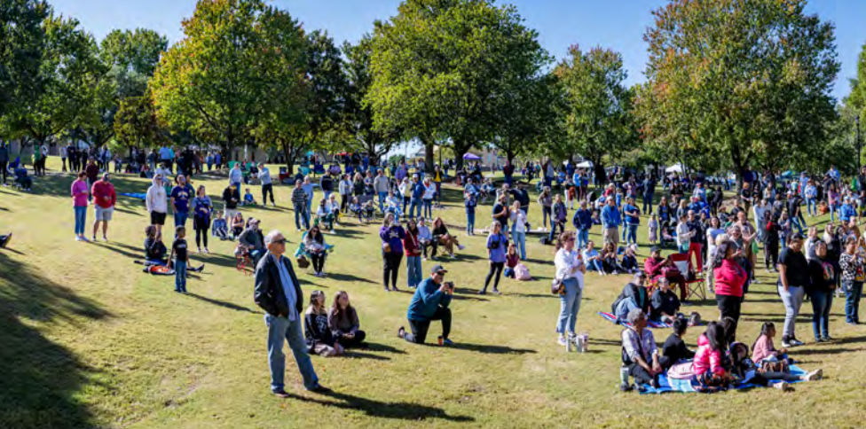
20th Annual Youth Arts Festival with an attendance of 10,000 with 700 performers