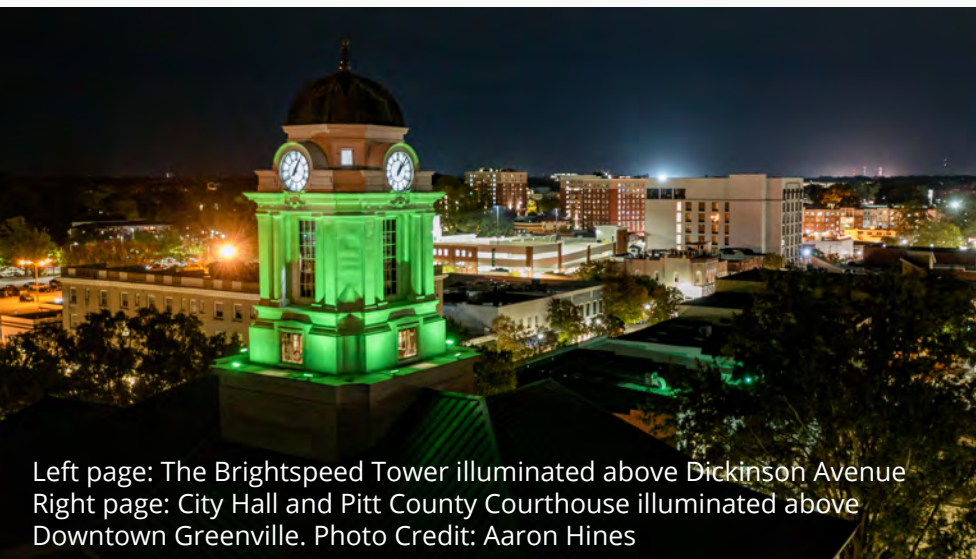
Left page: The Brightspeed Tower illuminated above Dickinson Avenue Right page: City Hall and Pitt County Courthouse illuminated above Downtown Greenville.