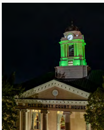
Pitt County Courthouse