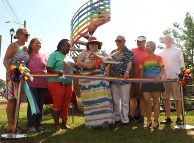
Paddock Club Memorial Sculpture