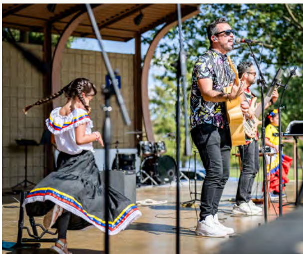
Inaugural Mosaic Multicultural Arts Festival