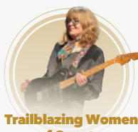
Trailblazing Women of Country