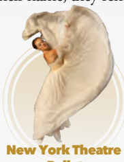
New York Theatre Ballet