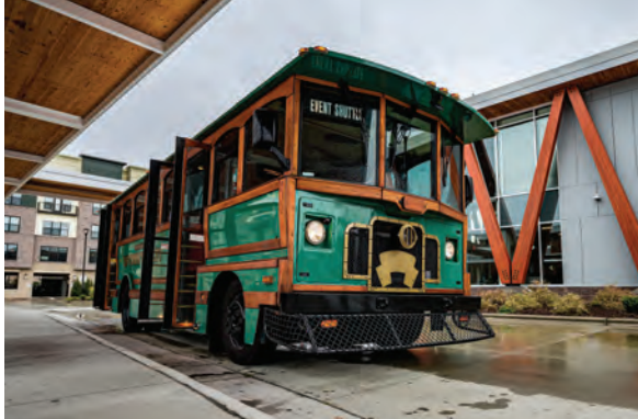
The Emerald Express Trolley

The City of Greenville also launched the Emerald Express, the pilot program for Greenville's Transit system that includes trolleys. With the success of the pilot program, the ultimate goal is for the trolleys to be "blinged up" (think of MTV's show "Pimp My Ride"), with Haddad/