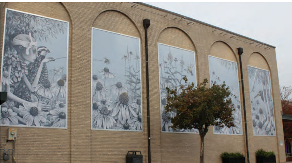
"Listening" mural by Beth Blake at Five Points Archway