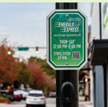
The Emerald Express has free rides Thursdays thru Saturdays.