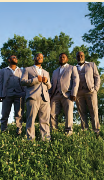
Dedicated Men of Zion