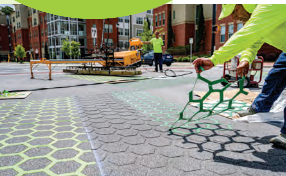
Installation image of the Intersection mural at Evans Street and Reade Circle

Years of planning and community engagement have signs of the district wide arts plan coming to fruition. The Emerald Loop, a multi-modal urban arts trail, is the project that over 20 stakeholders chose to undertake as part of the SmART Communities grant awarded to the Pitt