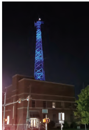
Special one night lighting of the radio tower

Future projects are the Emerald Loop Artistic Lighting Plan that includes over ten buildings and structures throughout the area. Some buildings included in the Vision Plan are the radio tower along 5th Street, City Hall, Pitt County Courthouse, as well as other privately owned buildings. Phase 1 of the Lighting Plan includes conceptual lighting plans for each entity and estimated budgets. Phase 2 which will begin next year includes the actual installation of the lights. Imagine driving over the 10th Street Connector and looking over and seeing 10+ buildings lit purple and gold before a game, or green and blue another night. Perhaps on Fridays there were a light show, with each structure changing colors.