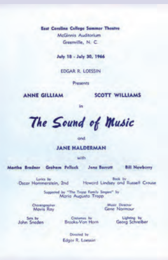
East Carolina University, School of Theatre & Dance Production Archives, "The Sound of Music" program, 1966

For nearly 50 years, talented young performers took the stage with seasoned