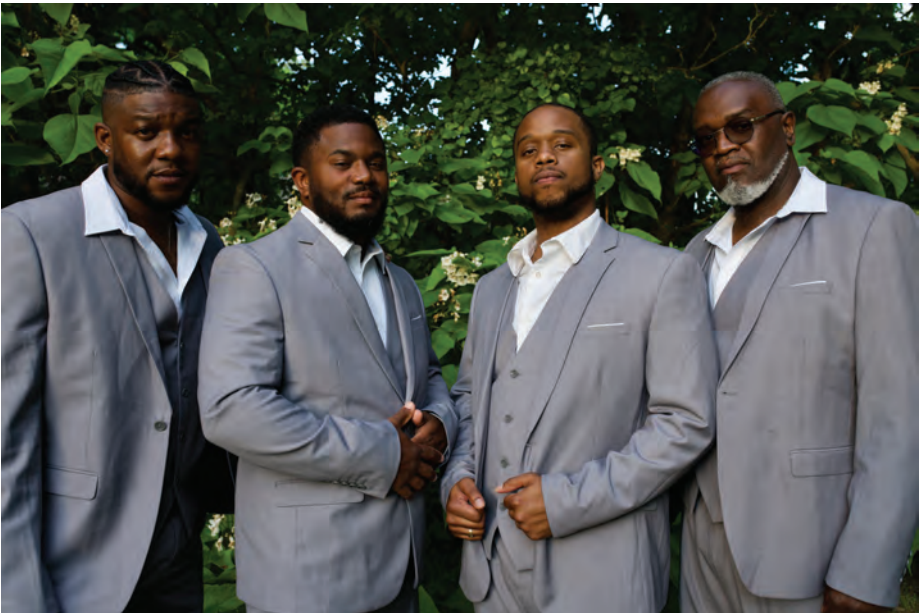
Dedicated Men of Zion